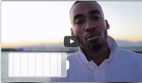
Can we auto-correct humanity? https://www.youtube.com/watch?v=dRl8ElhrQjQ