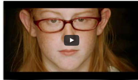
You wouldn't say it in person https://www.youtube.com/watch?v=0TJ9P_nDbTo

All videos can be found at www.thefrogandthefish.com/videos