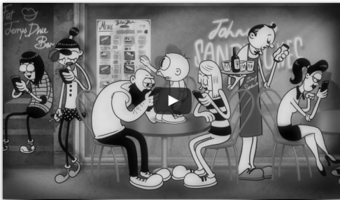
Are you lost in the world like me? https://www.youtube.com/watch?v=l3wjcwTcfT4

You might use one or more of these videos to generate engagement. Or you might use one at the end of the discussion with the focus being to critique the assumptions within the video. You might follow the viewing with questions like “What feelings did that video give you?”, or “Would this video be helpful to show young children? Why or why not?”, or “What do we learn about our culture in this video?”: